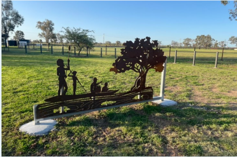
McGeever Recreation Grounds Sculptures and Signage

Providing an attractive and engaging welcome to Thallon