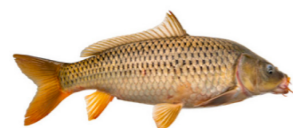
CARP (Cyprinus Carpio)