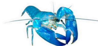
BLUE CLAW YABBY