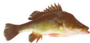
YELLOWBELLY (Golden Perch)